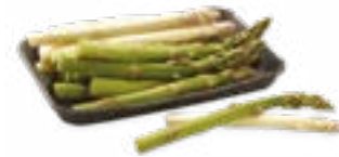
Ref.: Fruit 6M