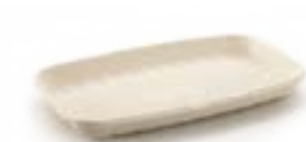
Ref.: OP 5 KHI