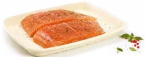
Ref.: OP 4 SK