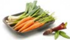
Ref.: Fruit 1