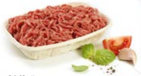
Ref.: OP 11 K