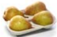
Ref.: Fruit Pear