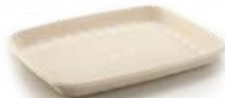
Ref.: OP 3 SK