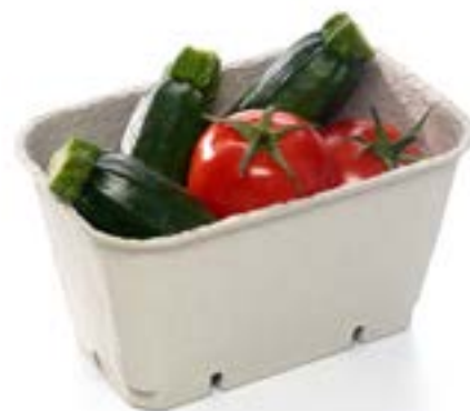
Ref.: MP 37