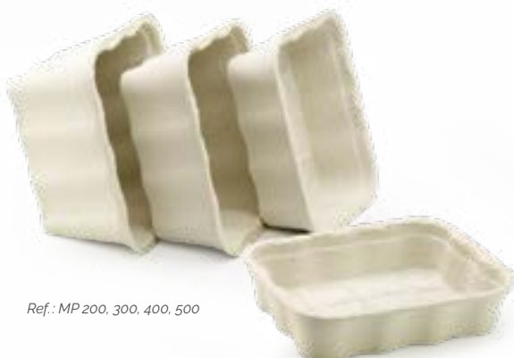
Ref.: MP 200, 300, 400, 500